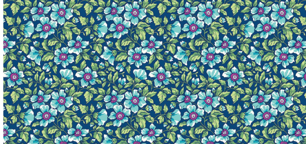
24973-49 | Bloom | Navy