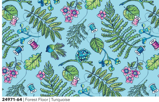
24971-64 | Forest Floor | Turquoise