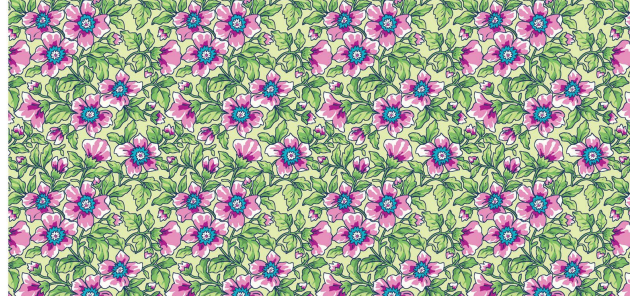
24973-72 | Bloom | Celedon