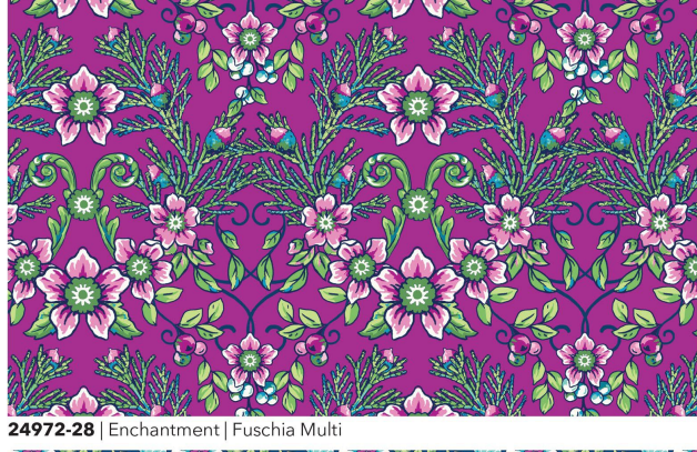
24972-28 | Enchantment | Fuschia Multi