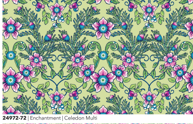
24972-72 | Enchantment | Celedon Multi