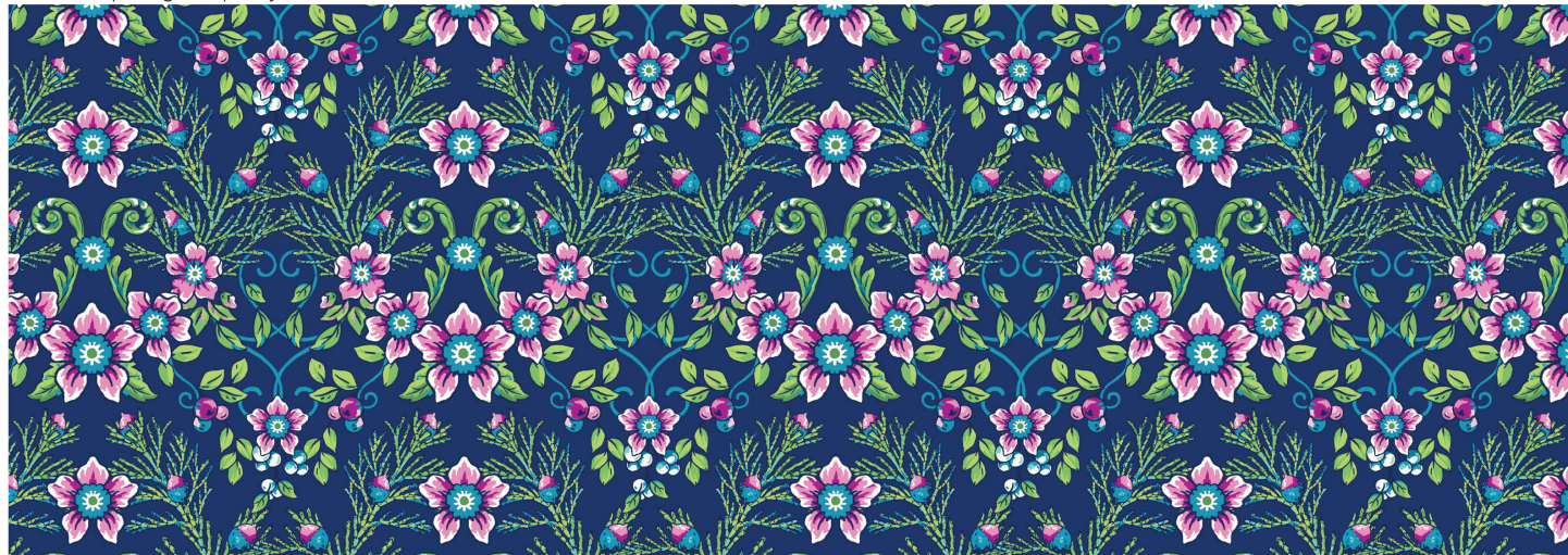
B24972-49 | Enchantment | Navy Multi