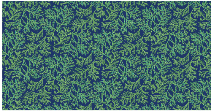
24975-49 | Evergreen | Navy