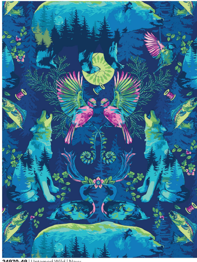
24970-49 | Untamed Wild | Navy