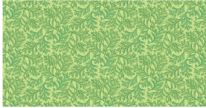
24975-74 | Evergreen | Sprout