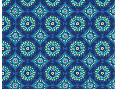
24974-49 | Natural Rhythm | Navy