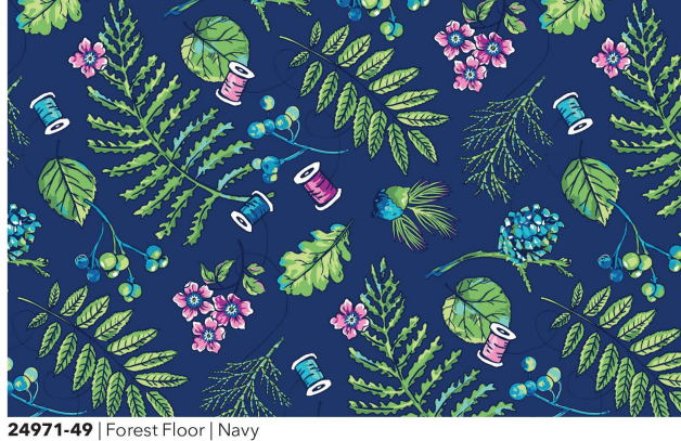
24971-49 | Forest Floor | Navy