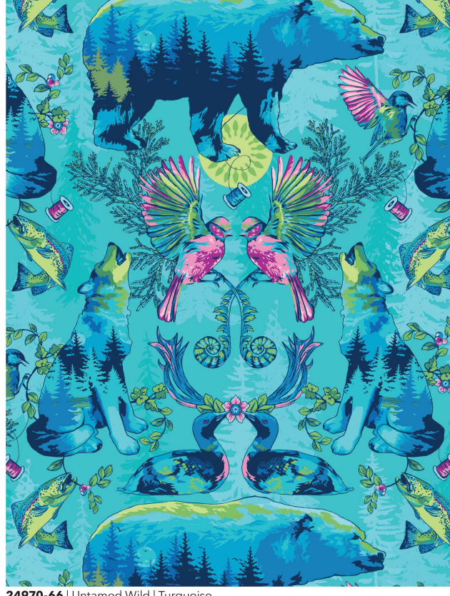
24970-66 | Untamed Wild | Turquoise